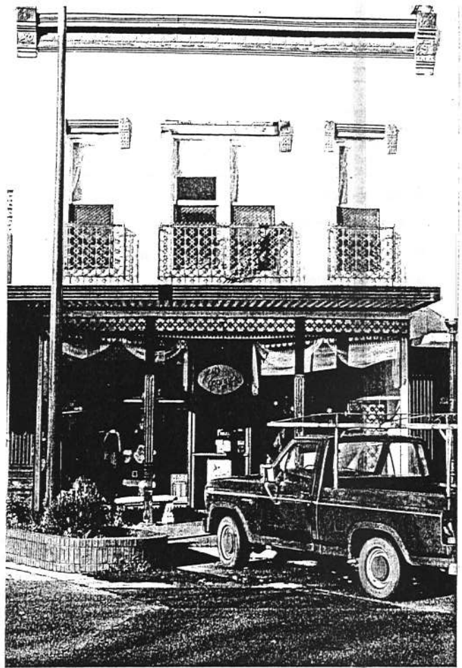
WEST SPRING ST.