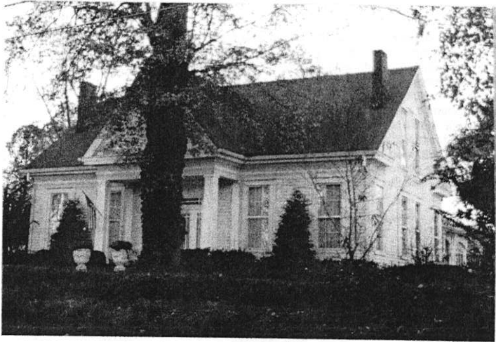
WEST WALNUT ST.